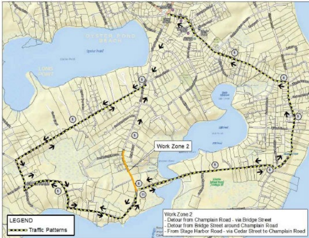
WORK ZONE 2 DETOURS - PLAN NTS

Please note that this is a projected schedule and will be adjusted accordingly based on the Contractor’s actual progress and the weather.